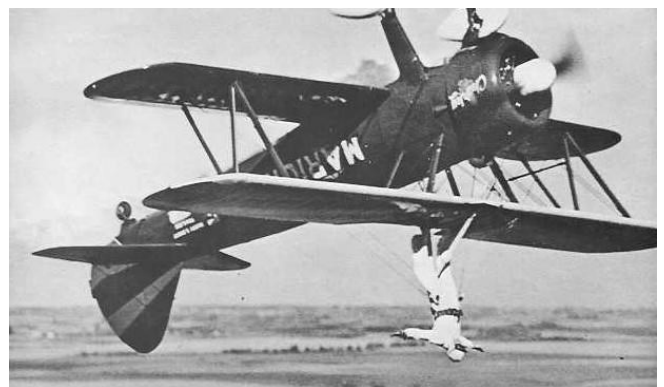
One of Marion's 450 Stearmans.