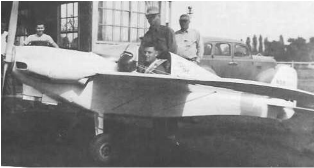
“Tater Chip” Peoria, IL early 50’s